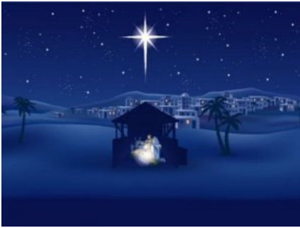
Birth of THE Son - Sep 11, 3 B.C. ?

The law firm which I am part of is named Rodyk & Davidson and we are celebrating the 150th year since our founding. We are the oldest law firm in Singapore and we are celebrating a most gracious anniversary (5 being the biblical number for Grace x 30) ! I thought that was most interesting and even more so when David means "Beloved" in the Hebrew.