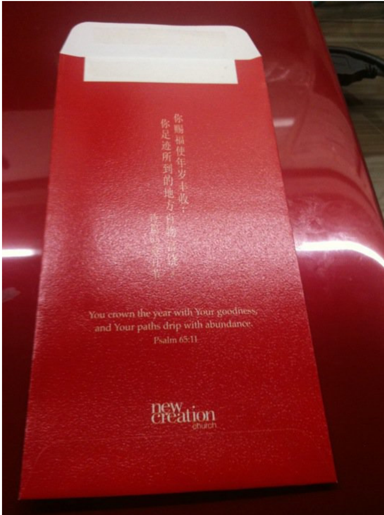
The 2010 ang pao from NCC featured the theme verse for 2011 -- Psalm 65:11 !

Psalm 65:11 “Thou crownest the year with thy goodness; and thy paths drop fatness.”